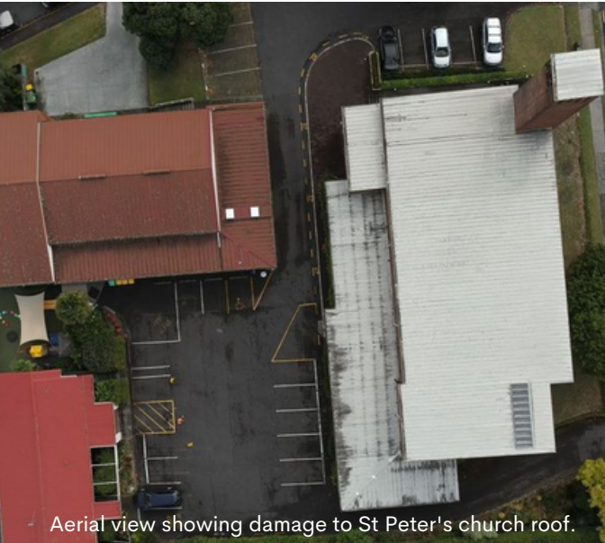
Aerial view showing damage to St Peter's church roof.

As a congregation we are determined to respect the heritage of the church building and ensure it is able to serve future generations of the Takapuna and wider North Shore communities.