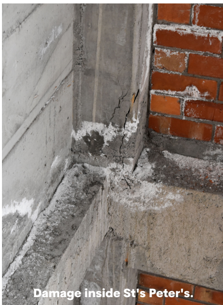
Damage inside St's Peter's.

Our commitment to rebuilding stems not only from a love of the church and its necessary safety, but also a desire to remain an integral part of Takapuna, and its surrounds. St. Peter's sees this as an exciting opportunity to enhance its relevancy and to be outward facing to its community. To achieve this St Peter's intends to reconfigure its interior to make it more flexible for a variety of worship and to address the ever-increasing need for community activity spaces. We intend to have a mezzanine meeting area, a kitchen hospitality area, offices, and bathrooms.