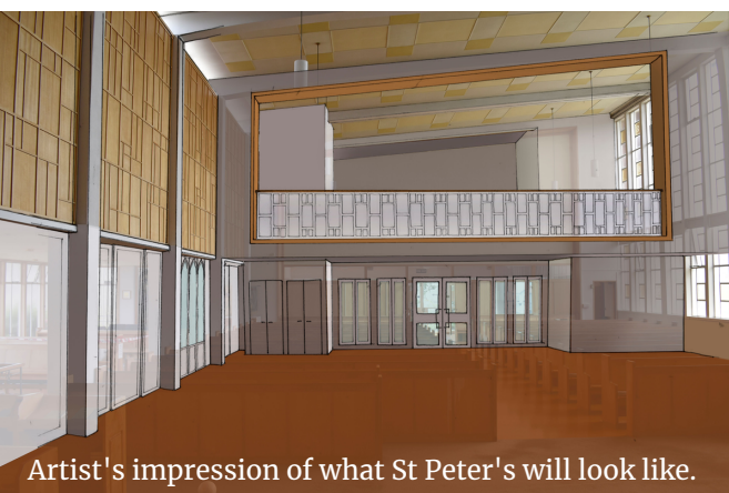
Artist's impression of what St Peter's will look like.

St Peter's has long provided spontaneous acts of support and compassion for the community. A few years ago, for example, following a tragic drowning on Lake Pupuke, the church swiftly made available its facilities as an operations base during the search and rescue exercise. Recently, in the aftermath of a house fire involving a church member, friends of St Peter's rushed to offer the family help including accommodation in the hall.